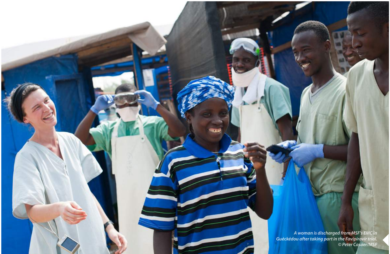
A woman is discharged from MSF's EMC in Guéckédou after taking part in the Favipiravir trial.