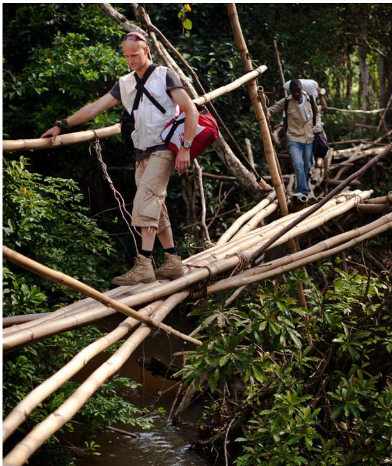
An MSF rapid response team in Grand Bassa county, Liberia.

EMCs to focusing on non-Ebola healthcare, health promotion and training.