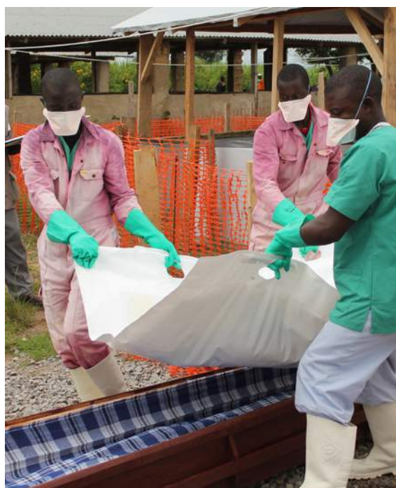
MSF hygienists safely place the body of an Ebola victim into a coffin in Foya, Liberia.

Fear and misinformation remained significant challenges throughout the first year of the response, particularly in Guinea. Raising awareness about the nature of Ebola is critical, because behaviours such as not touching the sick and seeking care early can significantly limit the spread of