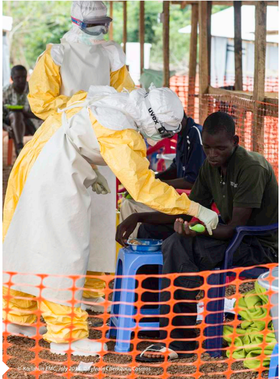
© Kailahun EMC, July 2014. © Sylvain Cherkouvi/Cosmos

contamination, more than 300 protective suits were required each day for a facility that cared for 100 patients.