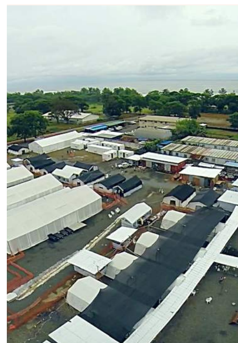
An aerial view of the ELWA 3 Ebola management centre, October 2014.