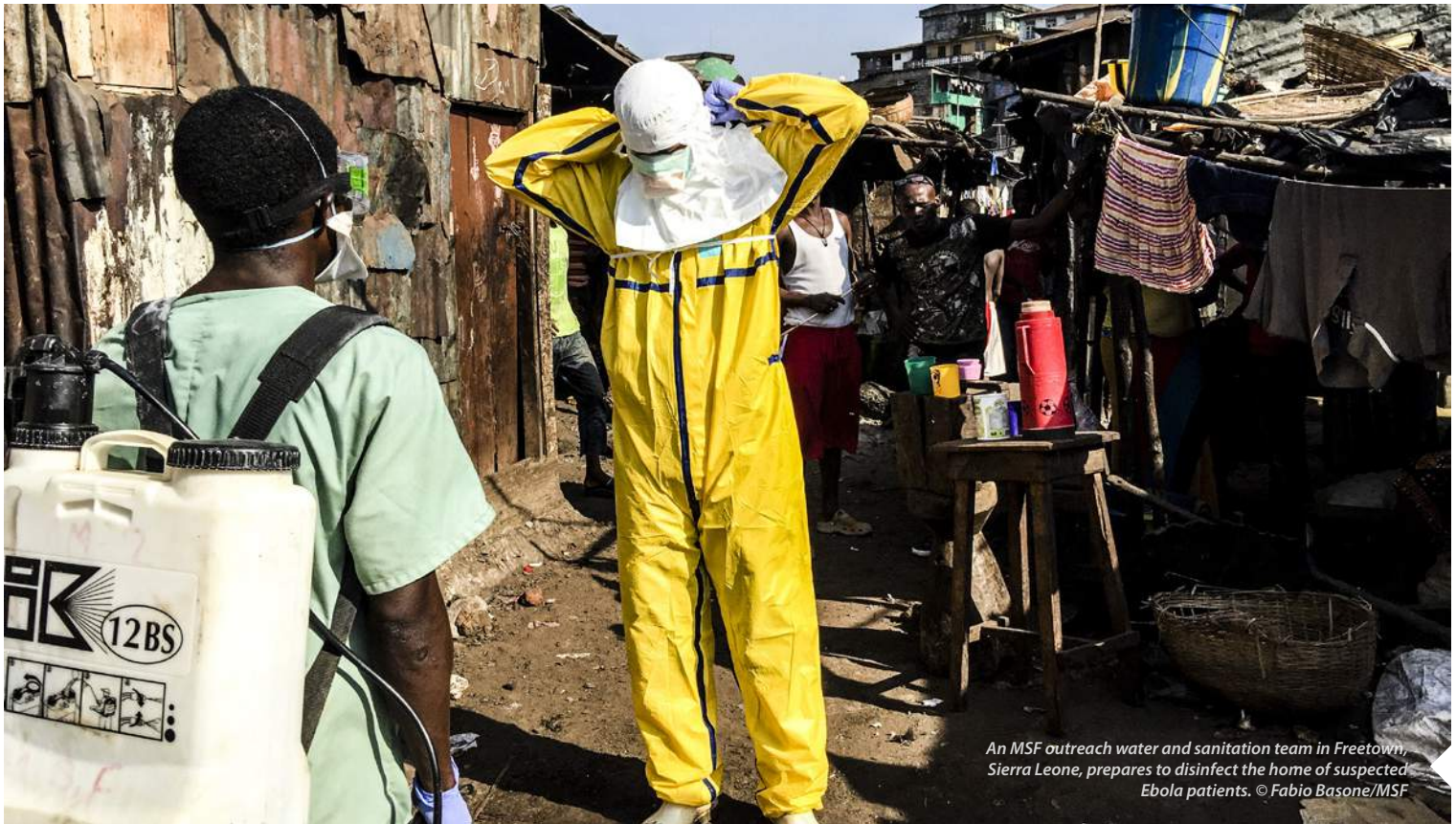
An MSF outreach water and sanitation team in Freetown, Sierra Leone, prepares to disinfect the home of suspected Ebola patients.