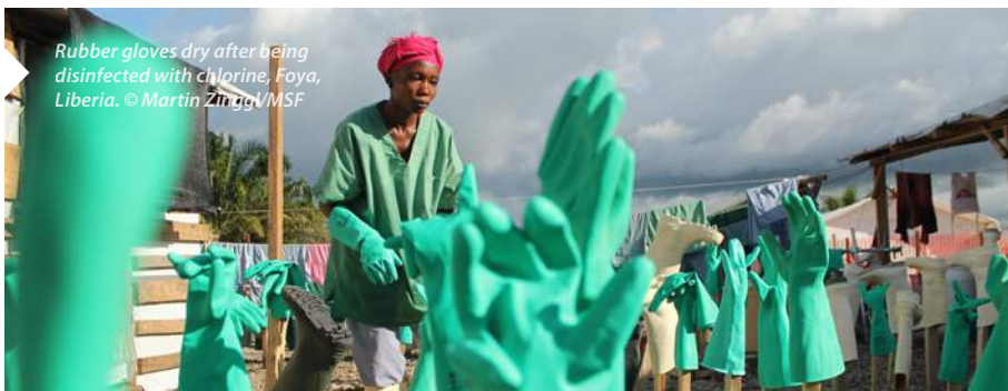
Rubber gloves dry after being disinfected with chlorine, Foya, Liberia.