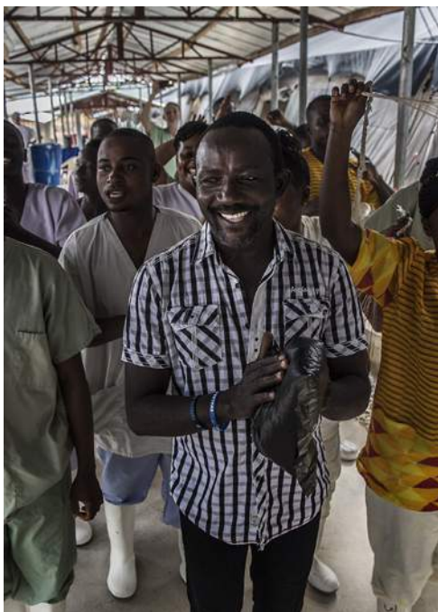
▶ An Ebola survivor celebrates his discharge from MSF's EMC in Bo, Sierra Leone.

Ebola cases were low across Liberia during 2015, with fewer than 10 new cases reported each week. By the end of March there was only one person with Ebola in the country. MSF progressively reduced its activities, and shifted the emphasis from running large